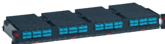
Panel 0 321 40 to be equipped with 4 cassettes 0 321 43