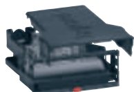
0 321 41