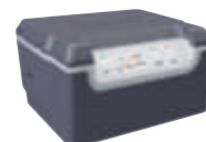
0 322 00